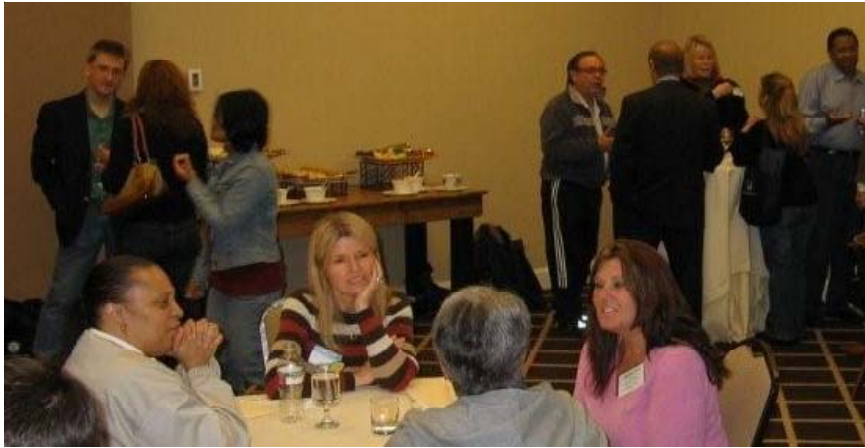
Above: Just a few of the people who stopped by our reception April 27, 2008 at the Seattle Sheraton, the evening before the Society for International Affairs' Spring Advanced Defense Trade Licensing Conference.