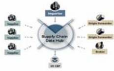
Central Information Hub

information hubs allow parties around the world to collaborate and interact online, with the same information though a single platform. Here are six tips that can help you select the right solutions to achieve ISF compliance and improve enterprise-wide data management efficiency.